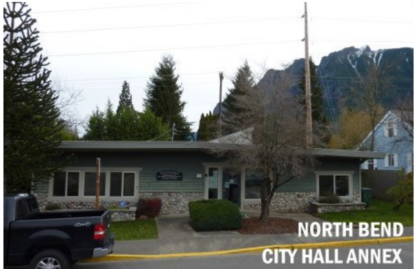
NORTH BEND CITY HALL ANNEX

Post Office Box 700, North Bend WA 98045 SNOQUALMIEVALLEYELK.ORG